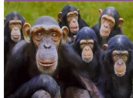
What a lovely bunch they are!